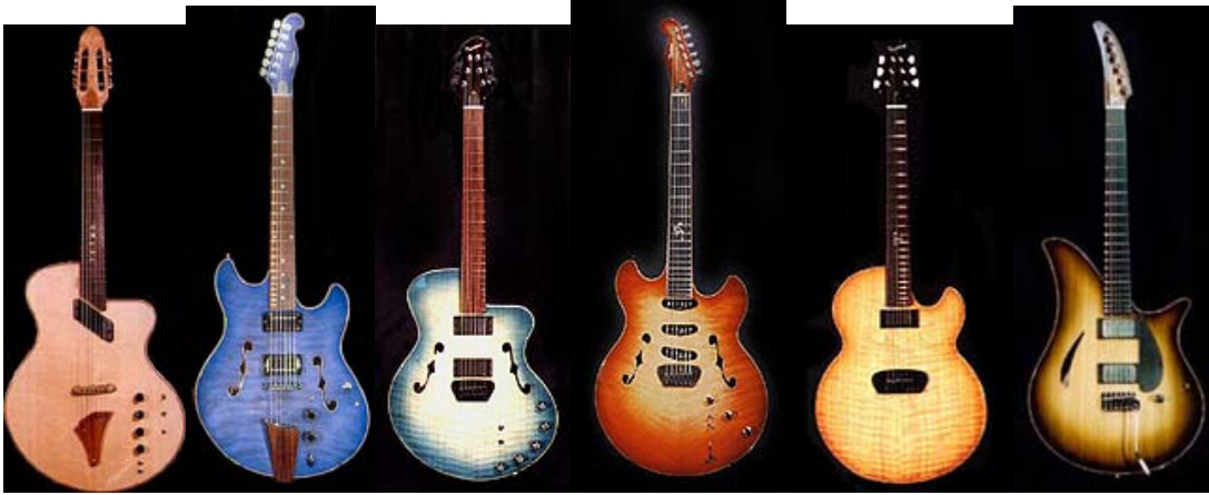
JZ (Acoustic) Starphish JZ-S BLOWFISH DC BLOWFISH (Acoustic) CHUBSTER