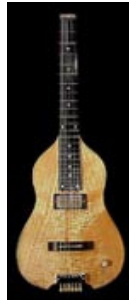
LAP DOG Lap Steel Guitar