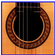
Mosaic Rose - Click Photo to Enlarge