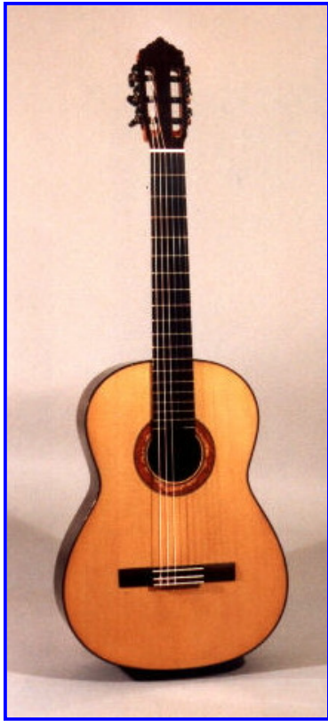
Blackwood Classic with Spalted Rose - Click Photo to Enlarge