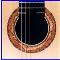
Spalted Maple Rose - Click Photo to Enlarge