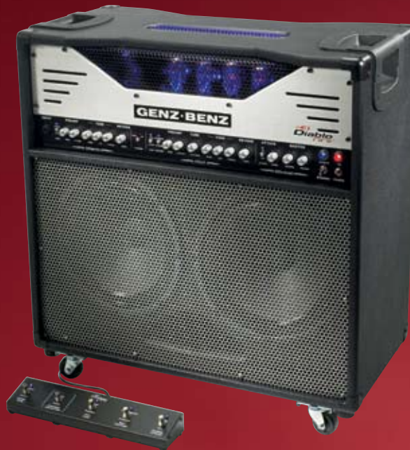
El Diablo 100-C