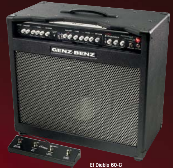
El Diablo 60-C