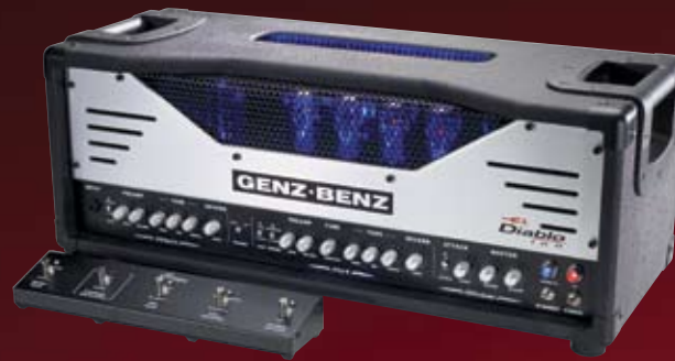
El Diablo 100

GLOBAL ATTACK – Boosts a range of upper mid frequencies that enhances pick attack and bite; extremely effective as a lead boost and for cutting through the mix.