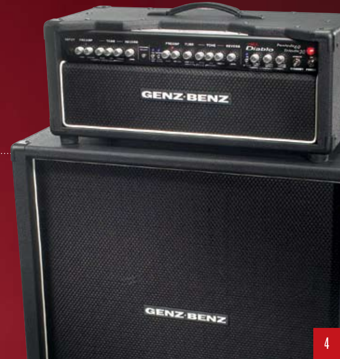
TS 412STBK ..... All Tribal Cabinets are now available in an optional black grille cloth.