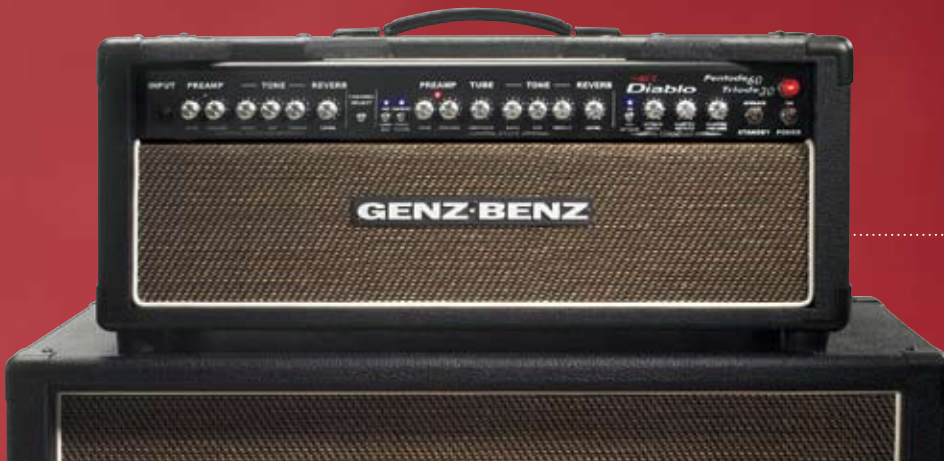
El Diablo 60-TS / Tribal Series Combination