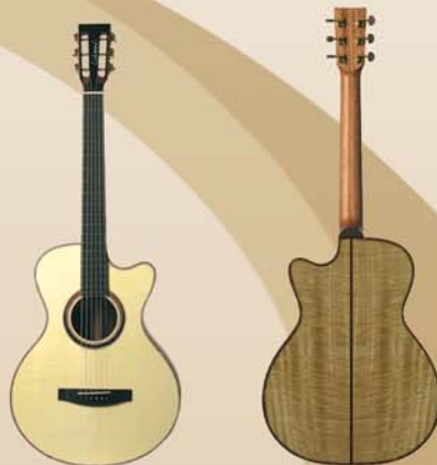
A-24 CP and M-52 CP