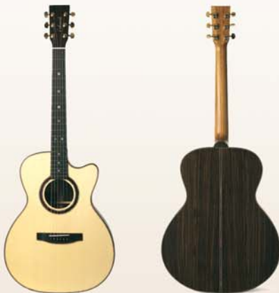
M-32 CP and J-32