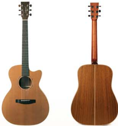
M-14 CP and D-18 CP